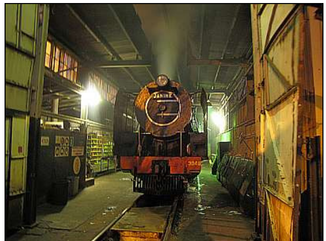
P20 – Steam Up!

The fire spreading turned out to be a bit premature, but just a little later, I rolled the lumpy fire out to a hot horseshoe shape and from then on, the temp raised steadily. Because of the over-full boiler, it wasn't at all quick but we had the whole night ahead of us.