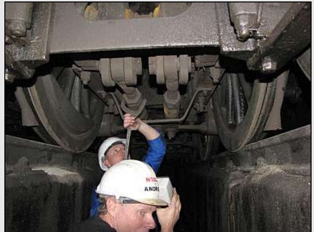
P18 – Tightening the barrels.

By the way, before anyone comments – RS locomotive crews are not required to wear hard hats unless overhead or workshop work is taking place in the vicinity of the locomotive.