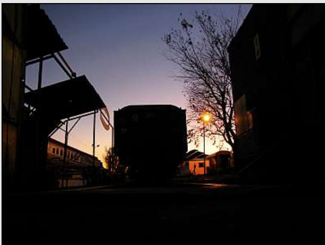
P19 – Tender back.

This isn't a repair, just a normal road worthy check.