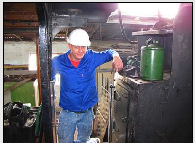
P02 – The Curse.

I officially only had one fire-lighting trainee today, but quickly ended up with three little duckies imprinting on me. It was a good and sociable light-up day with all the supplies laid on and everyone mucking in. But the usual blower rings and pipes seem to have disappeared. We had to salvage this one from hanging forlornly next to the ash-pit.