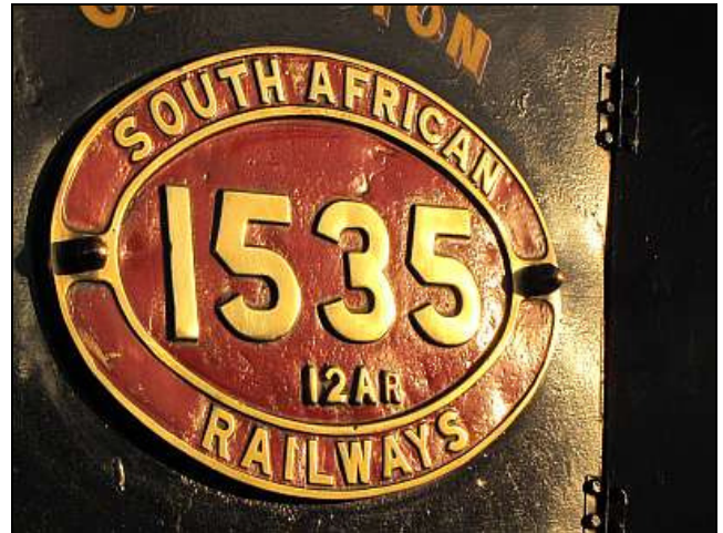
P08 – Evening 'Light-down'.

A steam leak in the super heater header area tends to 'fill up' the vacuum created by the exhaust steam jetting up half-venturi arrangement of the chimney's petticoat within the smokebox. The reduced vacuum means a reduced quantity of air pulled through the flues n' tubes, and in consequence, less air being pulled through the firebox. A steam locomotive relies heavily on the positive feedback loop of the blast gear pulling extra oxygen through the fire to produce power on demand. In motor car terms, it would be equivalent to an exhaust manifold leak up-steam from the turbo-charger, reducing the power of the engine because of the reduction in maximum boost.