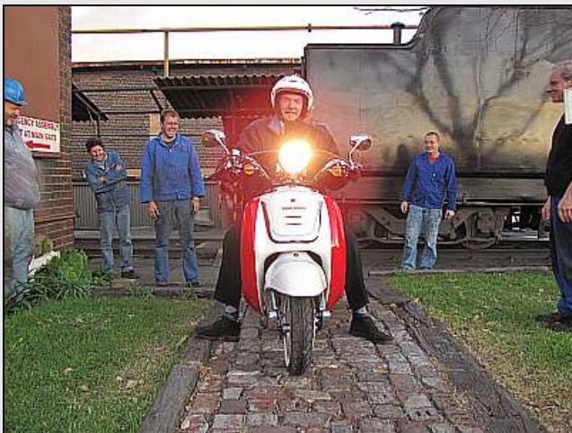
P15 – Show time!

He had reckoned without an occupied Receiving Track though and here he is providing some amusement as he tried to squeeze past the head-ached 12AR. It's not so easy to wheel a wide bodied two-wheeler along!