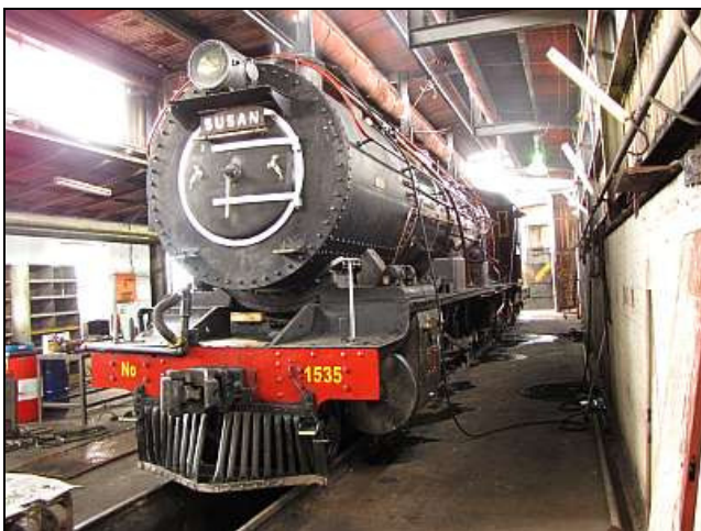
P01 – Today's First Light-up.

Other depot work for the day involved the fabrication of the vented doors for the donated generator within the Works Caboose. (The 'Hack Shack.') Said doors being a hefty but simple angle-iron frame and the door panels comprising of expanded steel. We learnt our lesson about engine ventilation in the old S&B van. In contrast to the S&B van installation, the 'new' generator is going to be run initially without ducting for the radiator. (If we can get away with it) On the plus side, the silencer is above the roof and the exhaust system is more compact with less heat radiating surface. The original double loading doors both need to have robust tie-backs and latches fitted, as the train will run with the doors open while the generator is running.