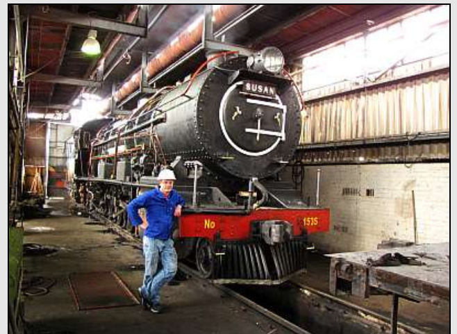
P06 – Proud Loco Lighter.

It is always a wonder that the grates don't melt or fuse, but the induced draft passing upward through the fire has a cooling effect.