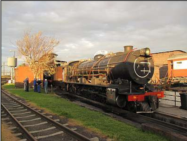
P07 – Laid Aside.

Little Susie was in steam and climbing at 400kPA at 3pm from a 9:45 light-up, so ... not too bad. Shaun Ackerman took over to shunt one hour early, as we still needed to get the lumbering great, cold 15F out of the way and coal up. Madame 'F' was in the doorway while the 12AR was in the back end of the shed where she had been worked on. The Tea Trolley was between them – where it had been used to hold the superheater elements.