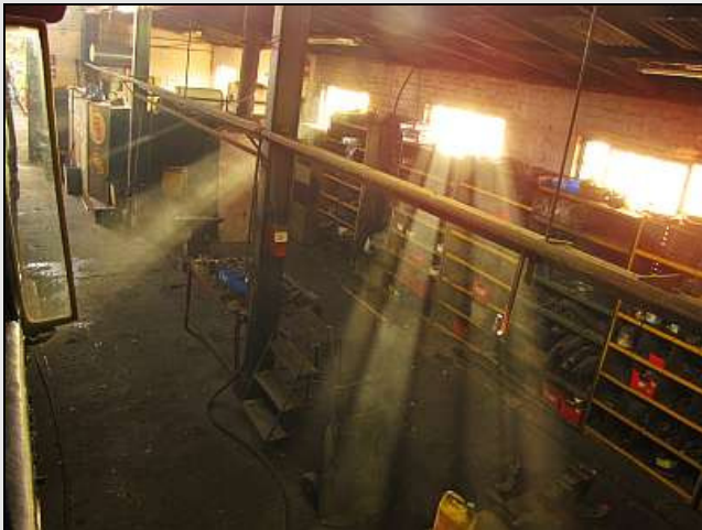
P11 – Sunbeams.