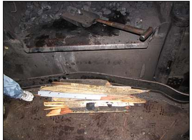
P04 – Confidence.

It is always fun to have train-loving youngsters around as they have that spark of excitement, enthusiasm and wonder that those of us who regularly work with the engines tend to lose, or even become a bit cynical about the old clankers.