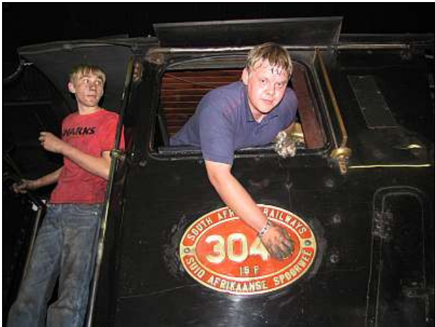
P17 – Finishing 'orf.