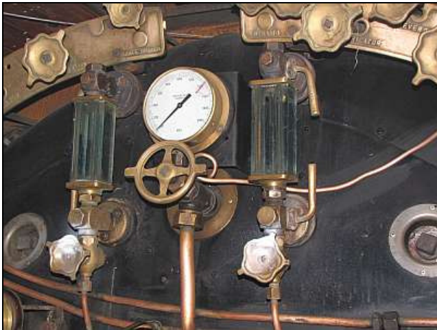
P13 – Marked test cocks.

Peter and Attie couldn't get the test cock drains to close, even with Attie standing outside and watching the drain pipes. A locomotive's test cock drains are plug valves and don't have 'stops.' They can be turned endlessly. On a pressurized boiler, they are easy to seat as you will see the water distinctively rise up within the glass tube when the valve is closed. On a cold boiler like this, you can only see by watching the discharge (or lack of) at the drain pipes.